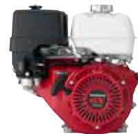
HONDA 13 HP GX390