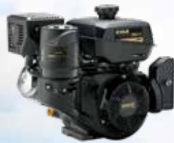
KOHLER 14 HP Command Pro CH440